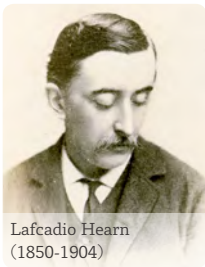
Lafcadio Hearn (1850-1904)

At the turn of 19th and 20th century Yeats and Hearn created novel works out of their encounter with Japan. Both writers injected new life into the old traditional stories which express the soul/spirit of their respective nations. Yeats used Japanese Noh and kyogen to reinvigorate his theatrical repertoire. This, in turn, led to a renaissance-like literary encounter between Japan and Ireland as well as more generally between the East and the West. Re-establishing this cultural exchange once again, but through a new 21st century perspective, would engender yet another theatrical renaissance marking the 60th anniversary of diplomatic relations between Ireland and Japan.